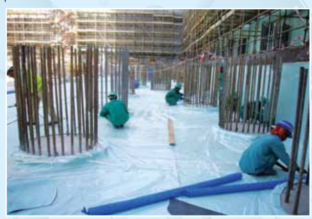
4 Basement - Pile Foundation - PVC WP System | Elite Residence Tower 4B+2P+39F