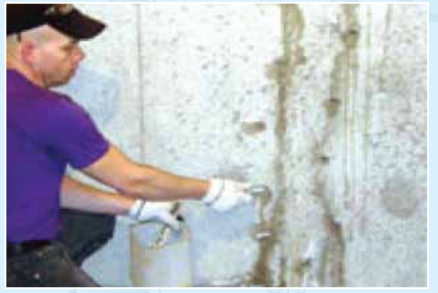
Crack and Leak Injection | Basement of Head Office Building | National Bank of Abu Dhabi