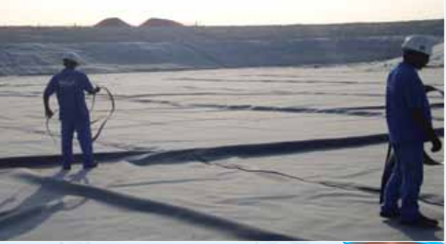
HDPE Lining Akoya Golf Course for DAMAC propertie Dubai.