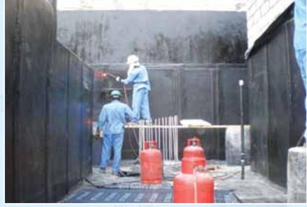
3 Basement Pile Foundation - Bitumen WP System | 3B+G+40 Tower at Jumeirah Lake Tower - Dubai